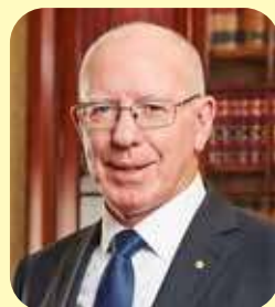
His Excellency General the Honourable David Hurley AC DSC (Retd),