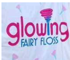
Glowing Fairy Floss