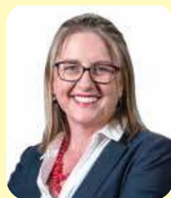
Hon. Jacinta Allan MP

I'd like to send my very best wishes to everyone taking part in the African Music and Cultural Festival. Victoria's proud African communities enrich our state so much, and the Festival is an opportunity to come together to celebrate and showcase the cultural heritage of all 54 African countries. Now in its tenth year, the African Music and Cultural Festival has a diverse and exciting program of live entertainment, cultural performances, and amazing food. Victoria is proud of our diversity and the events and festivals which foster cultural understanding and community connection. None of this would be possible without the hard-working community and cultural organisations who make the festival bigger and better, year after year. Our Government is proud to support the African Music and Cultural Festival, and thank you for all that you do.