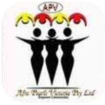
Afro Pearls Victoria