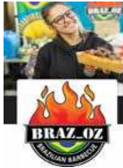
Baz Oz Brazilian BBQ