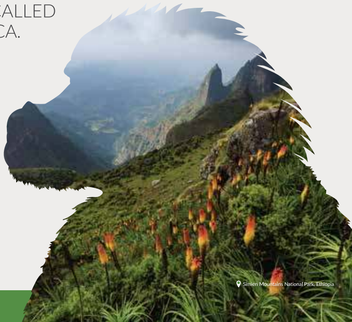
Simien Mountains National Park, Ethiopia

Discover more of Africa via Ethiopian Airlines. Visit ethiopianairlines.com or book now with a travel agent.