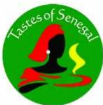
Tastes Of Senegal