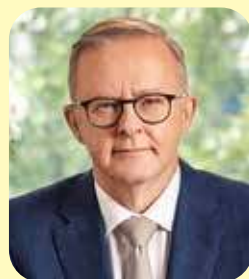
The Hon Anthony Albanese MP

The African Music and Cultural Festival is a wonderful opportunity for all Australians to share in the richness and diversity of Africa's great heritage and traditions.