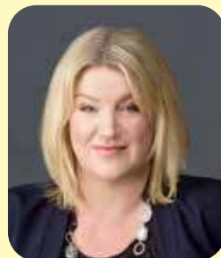
The Hon. Ingrid Stitt MLC Minister for Multicultural Affairs

As Minister for Multicultural Affairs, I am so proud to be part of a government that has committed $400,000 to the African Music and Cultural Festival, ensuring that events like this continue to bring Victorians together. I would like to thank all those involved with the African Music and Cultural Festival for your dedication to serving and supporting Victoria's diverse African communities and I am pleased to support this incredible festival.