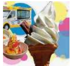
Alex Ice Cream