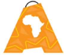
Africa_NearYou You are authentic