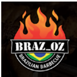
Braz Oz Brazilian BBQ