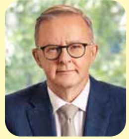
The Hon Anthony Albanese MP

I wish you every success for this year's festival and know it will be enormously enjoyable for everyone involved.