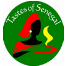
Tastes of Senegal