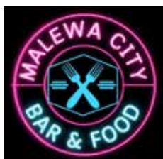
Malewa City Bar & Food