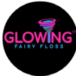
Glowing Fairy Floss