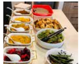
Melbourne Ethio Mothers Kitchen