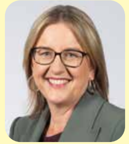
Hon. Jacinta Allan MP Premier of Victoria

I want to send my very best wishes to everyone attending the 2024 African Music and Cultural Festival. The festival is a brilliant celebration that reflects the diversity of more than 35 African nations. Through music, food, fashion, film, dance and art, we celebrate African cultures and recognise the enormous contribution of our African communities. I want to say a special thank you to everyone who has worked so hard to bring this event to life. It's a joyous, vibrant celebration that truly reflects Victoria's diversity. Enjoy the festival!