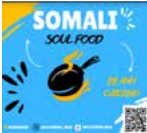
Somali Soul Food by ANH Catering