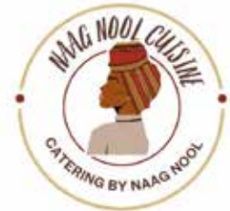
Naag Nool Cuisine