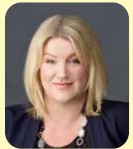
The Hon. Ingrid Stitt MLC Minister for Multicultural Affairs

Congratulations to the African Music and Cultural Festival (AMCF) on another incredible celebration of Africa's vibrant heritage. This festival is a remarkable showcase of multiculturalism in the heart of Melbourne. Through music, dance, food, and cultural performances, AMCF offers Victorians a unique opportunity to experience and connect with the richness of African culture. We are proud to be supporting this festival with $400,000 so that we can foster the values of diversity, unity, and cultural understanding that make Victoria the state it is. Festivals like AMCF are essential in fostering connections across communities, and it is encouraging to see the continued growth and success of this event. Best wishes for a fantastic festival, and thank you to everyone involved in making this celebration a reality.