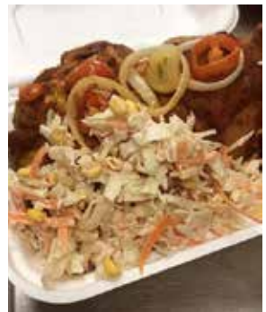
Unique African Intercontinental